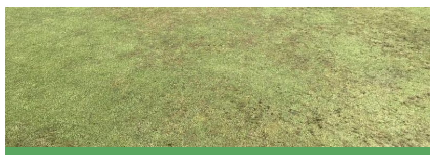
Before AquaCept application

Always conduct a bucket test and trial on an area of turf before tank mixing with other products