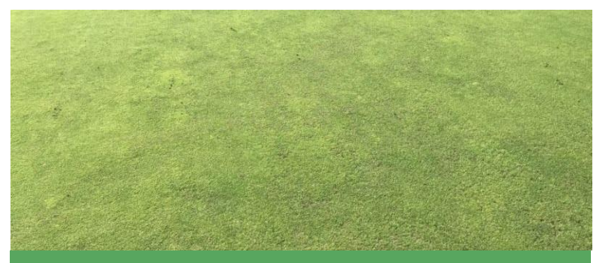
After AquaCept application